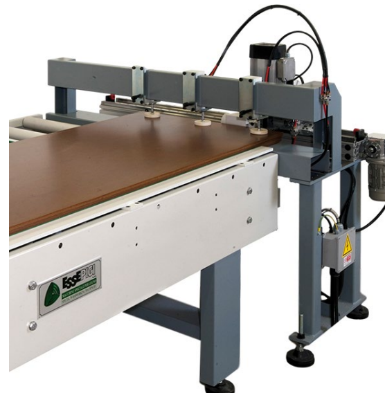
Grooving machine to execute bottom driving guide for sliding doors