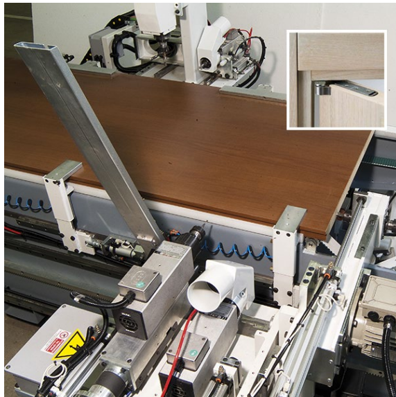
Milling device to execute pivot hinges' seat. Controlled axis by PC.